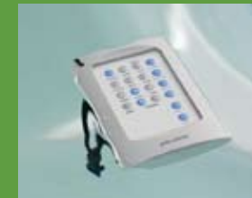
Poly-Planar stereos feature a floating remote control.

With your own Island spa in your back yard, total escape is within easy reach every day. An Island in-spa stereo system is the perfect addition to complete your luxurious retreat. Now, while your muscles are being soothed to a state of abandon, the sounds from your stereo system will lift your heart and soul. You will